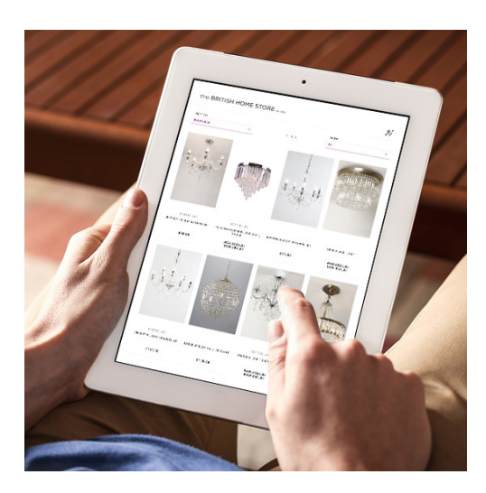
Designed, configured and implemented in 7 weeks

BHS successfully relaunched in the UK exclusively as an online retailer on 29th September 2016. They were able to do this by buying a new technology platform designed and built in under eight weeks. In Cloud Solutions and Greenlight Commerce worked in collaboration with BHS to design, configure and develop enterprise strength systems, using an agile approach and proven cloud technologies, including SAP Hybris and SAP Business ByDesign. Since launching, the retailer has quickly added to its portfolio with many new lines.